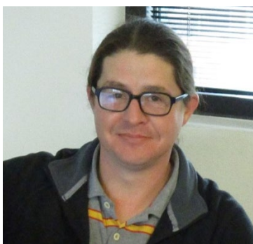
Central New Mexico Community College Student Support Services

As a first generation/ low-income student I was faced with many challenges and questions for which I had no answers; this was up until I found out about TRIO Student Support Services. It was during the spring semester of 2016, when I was offered a student employment position with TRIO, that I would find out that I had been working towards the wrong associates degree, so if I planned to transfer to UNM I would need to change my major. Lucky for me I was at TRIO, and that was right where I needed to be. I am proud to say that thanks to TRIO and their wonderful team, I am graduating. This is nearly two years sooner than I had previously figured possible. For reasons such as these, I believe TRIO to be an essential tool for any student and should be available for generations to come.