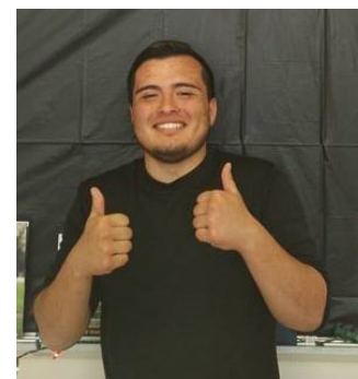
LULAC National Educational Service Centers, Inc Upward Bound

I am an eleventh grader at Valley High School in Albuquerque, New Mexico. Being a part of Upward Bound has given me many opportunities that I wouldn't have been able to experience if I had not joined the program. The tutoring program provided has helped me tremendously, just knowing they are there for me if I need any help. With Upward Bound, I got to visit two college campuses this year which was awesome. Finally, having Upward Bound as an educational resource to ensure that I am on the right track to graduation and college is something I am very thankful for!