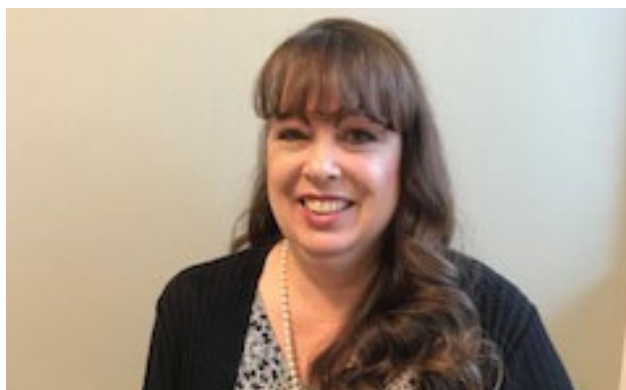
Program Coordinator, Student Support Services New Mexico State University

I would strongly recommend ELI to any professional that wants to take their leadership to the next level. It's an opportunity to develop yourself and join a community of like-minded, passionate people who are serving the programs in our state and region. The friendships you form and lessons you learn are invaluable.