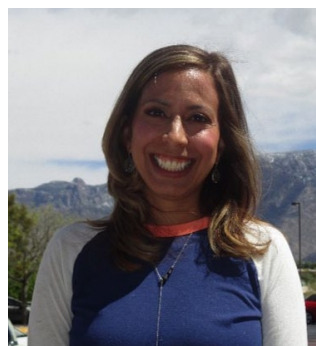
Central New Mexico Community College Student Support Services

I want to thank TRIO SSS for everything they have done to support me as I head into gradua-