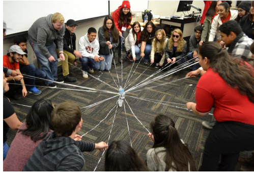
UNM SSS 2017 Spring orientation