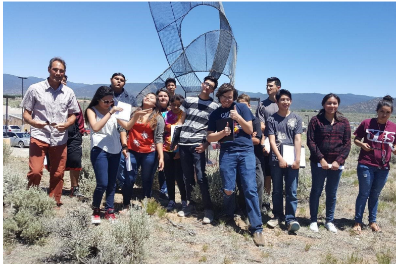
Upward Bound Math and Science students evaluating trails for the Taos Land Trust on the UNM-Taos Klauer Campus

cal care there as well. Therefore, students will be visiting the University of Colorado Health Science Center in Aurora and the University of Colorado in Denver and Metropolitan State University, both on the downtown Auraria campus. We will also visit Colorado State University School of Biotechnology and Veterinary Medicine in Fort Collins. This extended field trip will be a capstone to the summer experience.