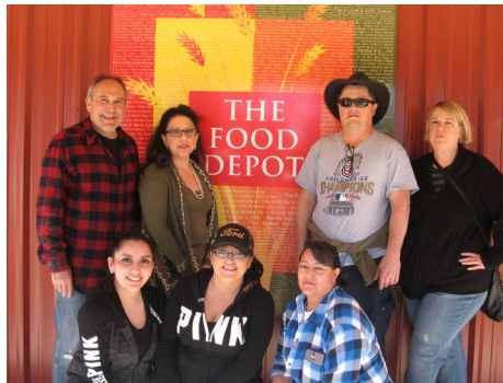
TRIO Student Support Services (SSS) students and staff from Santa Fe Community College doing community service at the Food Depot in Santa Fe.