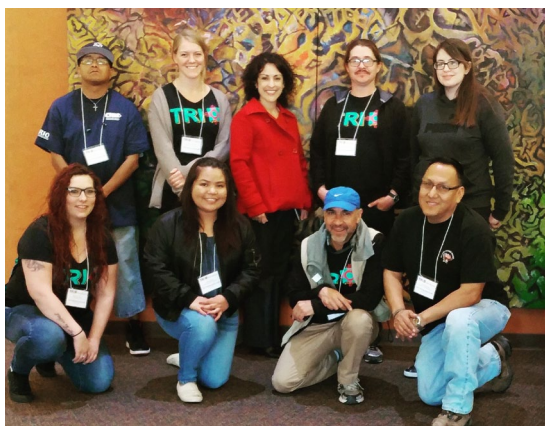
CNM Student Support Services at TRIO Day.

On March 3rd I had the honor of attending the "2017 NM TRIO Day" celebration. I was excited to meet other TRIO students and learn about their different programs. I, being a TRIO SSS student, was curious to hear other TRIO student's stories.