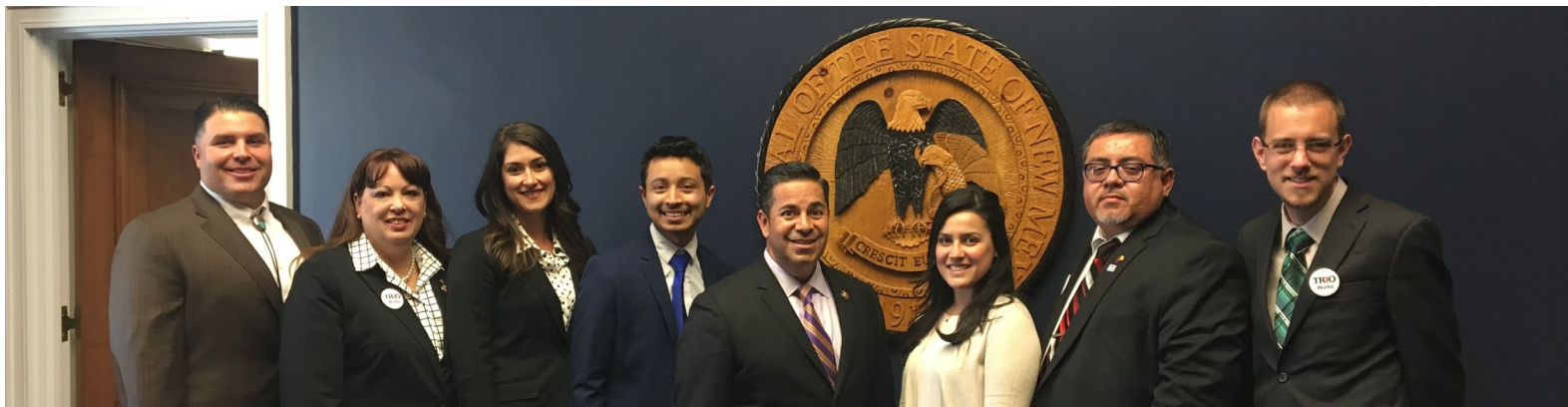
TRIO New Mexico Delegation with Congressman Ben Ray Lujan.