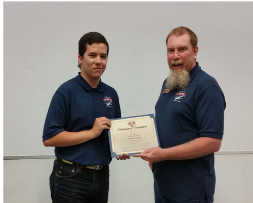
San Juan Community College Boot Camp Award.

This Bridge Program helped build the confidence and skills of our veterans returning to school. By the end of the boot camps, they had built their own peer support networks and found some of the camaraderie they have missed since leaving the service. This program also allowed us to ensure that the veterans were able to make the connections with Veterans Resource Centers and Student Support Services at each institution.