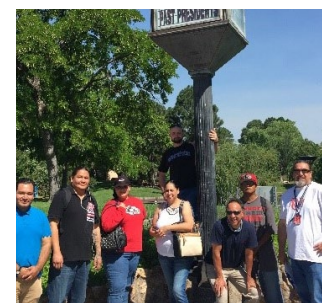
CNM SSS Students at UNM Duck Pond.

A highlight of the Walkabout was the lunch with McNair Scholars. Incoming students from CNM and UNM-Taos listened to UNM TRIO McNair Scholars tell their stories. It was very inspirational and motivating to hear the challenges scholars have overcome and how they are making progress toward their academic and professional goals.