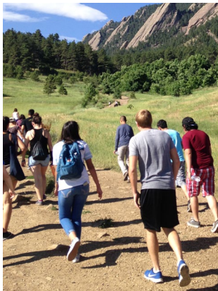
UBMS students in Colorado.

The New Mexico Tech Upward Bound Math and Science Program had the chance to visit three Colorado-based universities this summer. At the end of our 2016 Summer Program, about 30 of our students trekked across state lines in an extremely affordable travel bus where students were able to engage in cultural, educational, and eye-opening experiences that they may have not been able to do without the UBMS program.