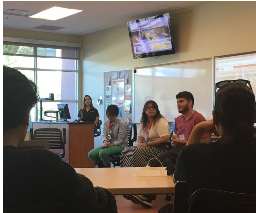
SSS-TRIO student panel.

UNM SSS students sat on a panel to share their own experiences in and out of class at UNM. To help break the ice, an interactive activity was provided by UNM Upward Bound staff. During lunch, attendees mingled with McNair scholars.