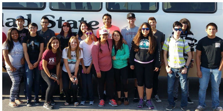
NMSU Upward Bound Students.

During the summer of 2016, twelve New Mexico State University Upward Bound students were selected as participants in the Math Science Upward Bound Program at Trinidad State Junior College, to participate in an interdisciplinary project based research experience examining effects of climatic and environmental change on their lives and in their communities.