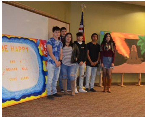
Students with the Upward Bound program with two murals. The "Depression" mural is being exhibited at the Belen Public Library, while the "Happiness" mural is on display at the Southwest Family Guidance Center