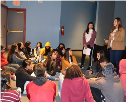
LULAC Upward Bound students at UNM.

The day's program held innovative group sessions for the students which provided a collaborative environment for high school students to interact with college students while developing skills to achieve their educational goals. The SSS students openly shared some of their college experiences to inspire, to voice their you-can-do-it mindset, and to share the multiple resources they've accessed to stay in school.