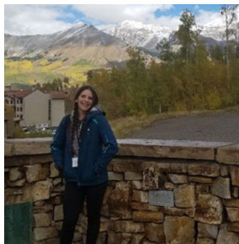
Central New Mexico Community College Student Support Services

Joining TRIO was one of the best decisions I made as a CNM student. TRIO provided me with excellent academic support, guidance, and encouragement by helping me work through hard math problems, talking with me about tough situations I was going through and always answering my questions or helping me find a source for the answer to my questions. TRIO provided me a lifelong advisor and friend that I still communicate with after graduating CNM. The resources that were available to me through TRIO really improved my studying skills, stress management and application writing which I will use the rest of my life. I want to be confident and successful in my academic career and joining TRIO was the best first step towards that goal I could've made.