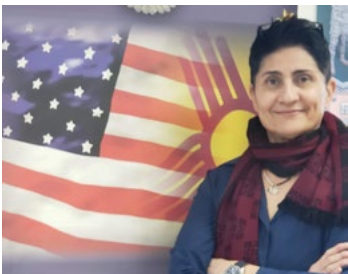
University of New Mexico Taos Veterans Upward Bound

Without the support from the VUB program for Veterans, I would not be able to complete my degree in Psychology and improve my marketing potential. I am so grateful for VUB.