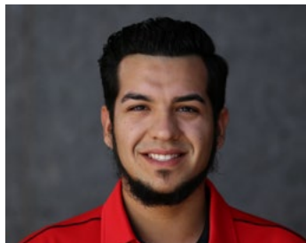
University of New Mexico Upward Bound

Upward Bound is a major reason why I am going to school as far away from home as I am. Not only did they help get me ready for college/life, they remained closely by my side until I felt comfortable enough to continue without them. Upward Bound has helped with things such as letters of recommendation, scholarship/college applications, life-preparing workshops, and countless other things that even include life-changing summer trips. In addition to all of this, Upward Bound follows you wherever you go and they truly are always there for you if you need something. For all of this, I am eternally grateful."