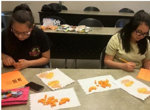
Cheetos were used in my class to explore the relationship between Surface Area and Volume.

The approach of blind memorization is all too common. When I asked my tutors what Pi was? They proudly responded with “3.14159”. Okay, yes, that is the numerical value of Pi, but what is Pi actually? Pi is this beautiful number that is derived when one divides the circumference of any circle in the universe by its diameter. It doesn't matter if one is dividing the circumference of the moon by its diameter, or the circumference of an engagement ring by its diameter. Every circle in the universe abides by the same rules. That is the beautiful thing about geometry. Geometry is the foundation of Physics, it is the understanding of shapes, and almost every formula can be derived using simple explorations.