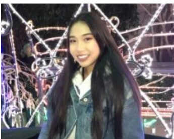
University of New Mexico Student Support Services

Student Support Services-TRIO at The University of New Mexico aided me in the transition from Manzano High School to my new college environment. They really helped me to adapt to the new UNM community by providing me a Peer Coach and an SSS Advisor. The TRIO staff opened my perspective of the abundant resources available to me on campus. In terms of academic habits, SSS helped me to understand the course listings, cre-