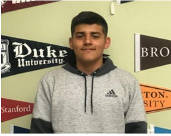
LULAC National Educational Service Center Upward Bound

I am a junior at Atrisco Heritage Academy High School in Albuquerque, New Mexico. I joined Upward Bound spring semester of sophomore year. Upward bound helped prepare me for my junior year with the Summer Institute that they offer. I also got the opportunity to travel and visit Grand Canyon University & Arizona State University in Phoenix this past summer. We learned about those colleges and got a tour. Since joining Upward Bound I have gained knowledge about the college process, and many new things that I otherwise wouldn't know today if it weren't for the program. I have met so many new people during our combined Saturday Academies with Highland and Valley High School. I have also received lots of help with my school work during the after school tutoring. I've recently been given the opportunity to join new programs like LULAC and the STEM class that Upward Bound is offering this year. In the STEM class I'm learning how computers work and how to code. I am also now the newly elected president of the LULAC Youth Council. Thanks to Upward Bound I have gained knowledge about college, obtained help with my homework, met new people, and attained access to new opportunities that will be beneficial to my future.