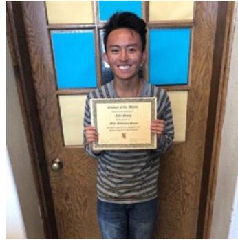
LULAC National Educational Service Center Upward Bound