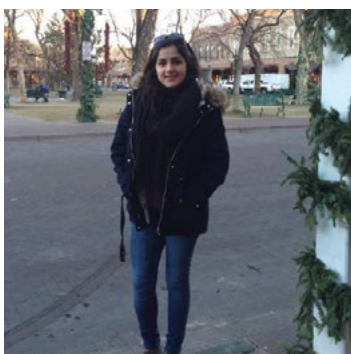
Central New Mexico Community College Student Support Services

As a high school graduate and an English learner, I felt nervous about entering the college environment. However, I was very lucky and was introduced to the TRIO program during the first semester of college and I stayed active in the program until I graduated from the Central New Mexico Community College. The TRIO family provided tremendous support and guidance throughout my time in the program. They assisted me with great academic, financial, and personal advice whenever I needed it. Because of that, I had a great experience for my first two years of college, and I was able to successfully graduate and transfer to a 4-year university.