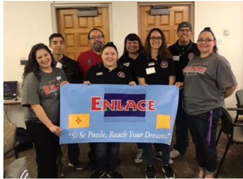
Northern New Mexico College ENLACE presented the student leadership workshops.

I want to thank all of the hard work of our entire association, board, and each committee in working to make this association the unique success that it is. Thank you for working to award scholarships to our students; making flyers for different events; learning new website features; posting to social media; participating in countless meetings, webinars, and conference calls; and demonstrating dedication to our cause. TRIO really does work not just to support our students, but to support our staff and professionals. Thank you for allowing me to lead this brilliant association!