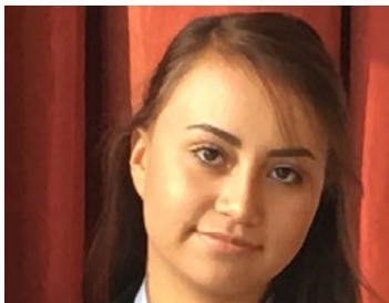
LULAC National Educational Service Center Upward Bound

How Upward Bound has helped me is that they have given me information on college and the resources needed to get into college. They let me know what I need to be prepared for college and make sure that I have everything, in order, so I can go to college. Upward Bound has also helped me by making sure that I have good grades and that I stay on task. Whenever I need help on homework the tutors are always happy to help me. I have become more open-minded because of Upward Bound and they encourage me to always strive for success. They have provided me with knowledge, helpfulness and friendliness. Upward bound over all is a good program to be in.